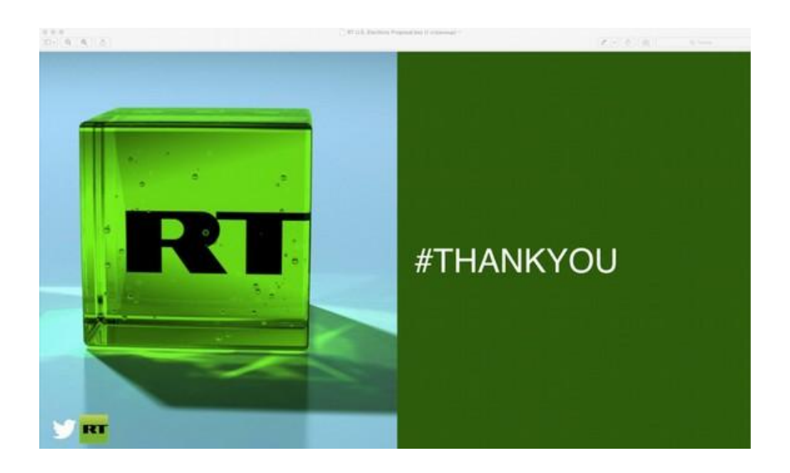
READ MORE: 'Twitter ban of RT ads part of coordinated attack on Russian media & freedom of speech'